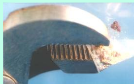
Crush single seed