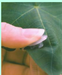
Obtain Leaf Tissue

Contact EnviroLogix to order bulk-packaged kits. Bulk kits include EB2 Extraction Buffer Concentrate. To prepare 1 liter, mix 50 mL 20x Concentrate with 950 mL of distilled or deionized water. Store refrigerated when not in use; allow to come to room temperature before using.