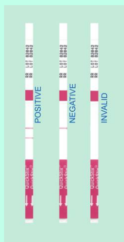
Any clearly discernable pink Test Line is considered positive