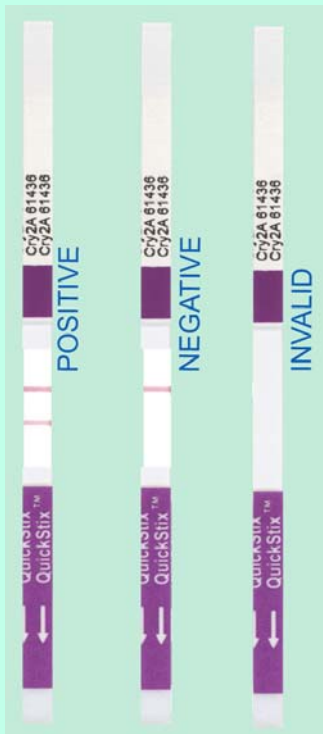
Any clearly discernable pink Test Line is considered positive